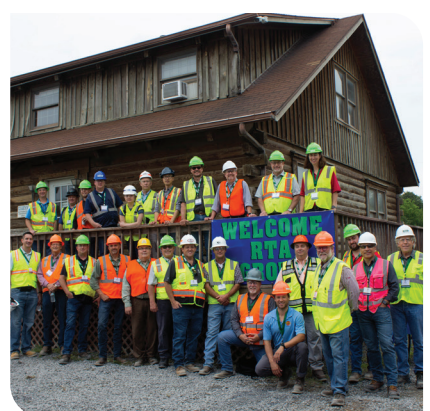
The group pauses for a photo at the Stella-Jones Goshen plant.