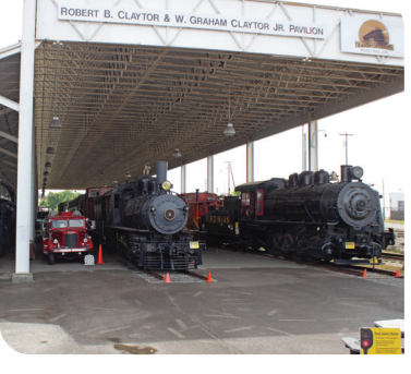
The group was able to spend time learning about the history of transportation in the Roanoke area while Norfolk Southern trains passed by adding train whistles to the atmosphere.