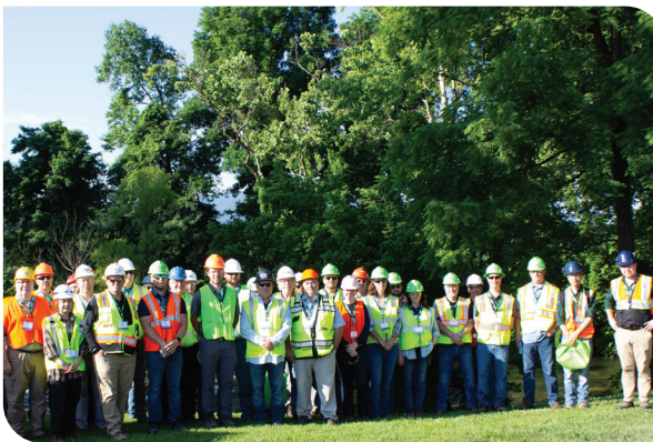
The group enjoys a quick photo on the banks of the Roanoke River at the Koppers plant.