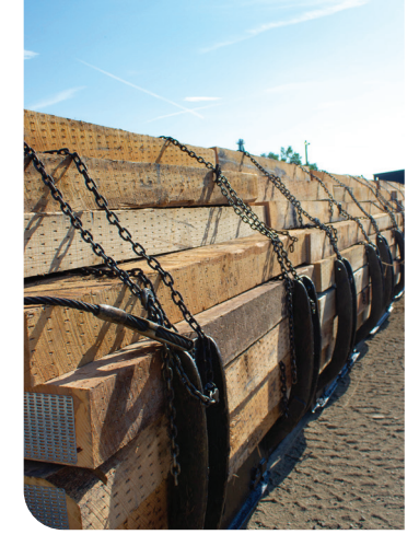
Ties on a tram ready to head into the cylinder for treating.