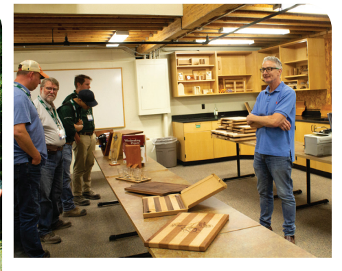
The group learned how the students at the Brooks Forest Products Center at Virginia Tech create a business selling wood products they conceive and produce themselves.