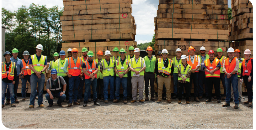
Group photo at the Allegheny Wood Products Princeton, W.Va., facility.