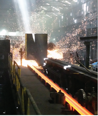
A hot saw is used to cut rails to length.