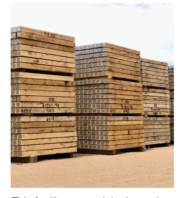
This facility uses stickering rather than German stacking to control air-drying speed in the drier Denver climate.