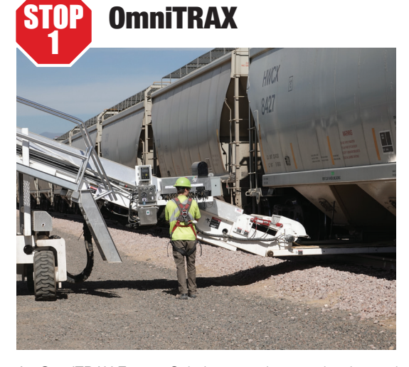
An OmniTRAX Energy Solutions employee unloads sand from railcar onto high speed conveyor for transfer to truck.