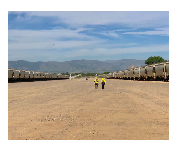
OmniTRAX's very impressive double track transload operation.