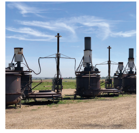
Some of the onsite BioChar NOW! reactors in action.