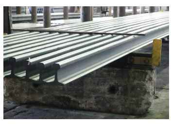
Lift of rails ready to be placed in storage racks for cooling.