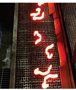
Rail anchors after forming.