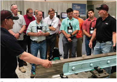
Standard 6 hole insulated joint.