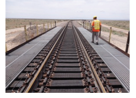
Open-deck bridge ties on the 65-foot span of the East Steel Bridge. The ties are Douglas fir with 10-inch-wide Progress Rail Loadmaster<sup>™</sup> plates. Hook bolts are standard J bolts.