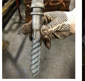
Lewis Bolt patented Evergrip<sup>®</sup> Spike.