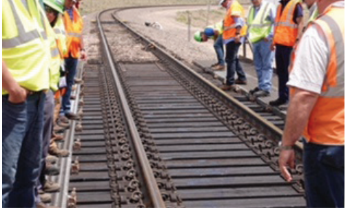
Open-deck bridge ties on the 55-foot span of the East Steel Bridge. The ties shown are a mixture of glue-laminated timber and Southern Yellow Pine. The fastener system is 8-inch-wide Progress Rail Loadmaster™ plates. The hook bolts are Lewis Bolt & Nut Quick-Set® hook bolts.