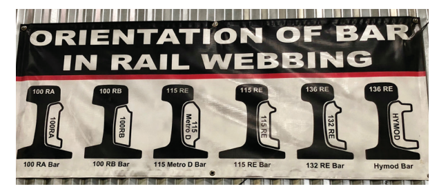
Multiple rail weights and profiles require just as many joint bars.