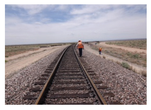
Standard hardwood ties with cut spikes and anchors in open track.

A closeup of the Lewis Bolt & Nut Quick-Set® hook bolt assembly. The hook bolt is inserted between the ties instead of through the ties and is set at an angle instead of the standard vertical placement. The assembly can be installed from the top of the bridge versus the typical insertion below the deck.