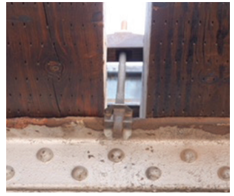
A view under the state-of-the-art bridge showing the Lewis Bolt & Nut Quick-Set<sup>®</sup> hook bolt assembly. The photo also shows the lack of dapping of the superelevated glue-laminated bridge ties. The angle of the hook bolt can be seen in the photo.

A closeup view of superelevated glue-laminated opendeck bridge ties on the state-of-the-art bridge. The ties have the superelevation built into the tie and are not dapped on the bottom. The deck uses the Lewis Bolt & Nut Quick-Set® hook bolt system to provide the active attachment of the deck to the bridge.