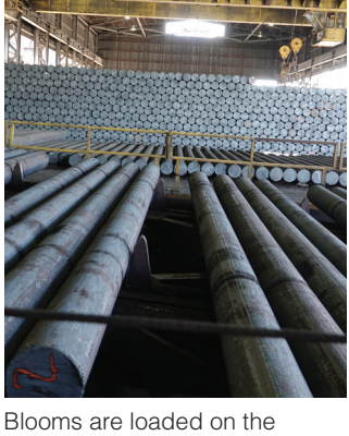
Blooms are loaded on the re-heat furnace charge bed.