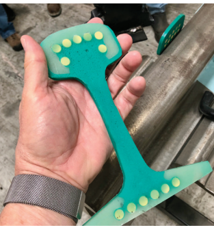
Ceramic end post goes between rails.