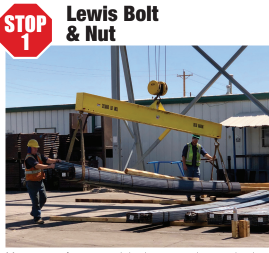
Movement of raw material prior to entering production.