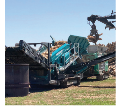
Biomass feedstock (which could include end-of-life ties) is chipped for collection for reactors which produce the biochars.