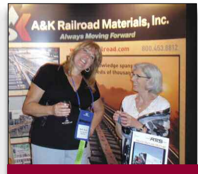
RTA members enjoy meeting with A & K Railroad Materials Inc. reps at their booth.