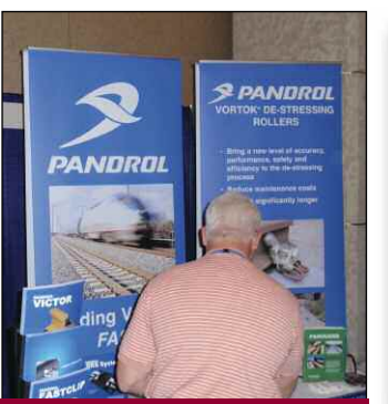
Pandrol also had a tabletop exhibit at NRC.