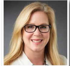
Darr, President, ASLRRRA

It works because it allows small businesses to prioritize infrastructure investment based on market demand instead of politics. It can and should be an important part of what appears to be a bi-partisan agreement to rebuild America's infrastructure.