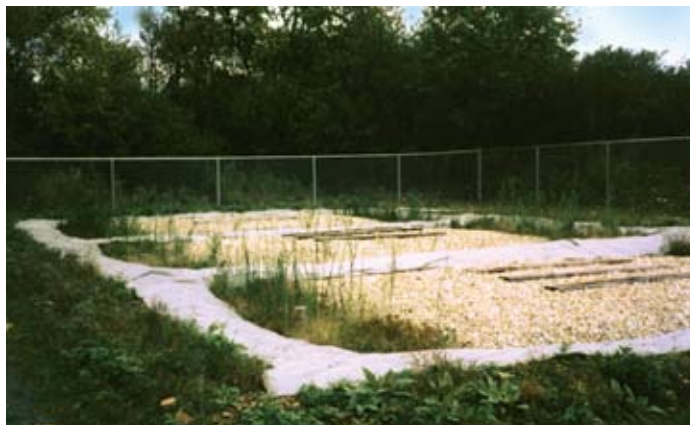
Figure 1: Railway tie study mesocosm as it appeared in November 1998. Three treatments included new and used creosote-treated railway ties plus untreated control ties. The vegetation community growing within the constructed wetland area adjacent to the ballast is dominated by wetland species.

The study required by the USACE was undertaken in 1998 and completed in 2000 using protocols approved by the U.S. Fish and Wildlife Service including strict quality assurance requirements. The study created a mesocosm wetland in May of 1998 that mimicked the area where the railway passes through the Des Plaines wetland. This included lining of three excavations with impermeable surfaces; providing a subsurface source of water to mimic the wetland's hydrology; placement of wetland soils from the Des Plaines wetland; and placement of three sections of railway ties on ballast constructed in a manner identical to the actual line (Figure 1). The three treatments included a section of old ties, a second section of new ties and a third section with untreated oak ties. Each of the sections was isolated from the others and great care was taken to prevent contamination during construction and sampling. Wetland hydrology and soils created an environment in which a rich wetland plant community developed in areas outside the ballast (Figure 1).